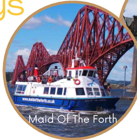
Maid Of The Forth

Please note excursion days are subject to change.