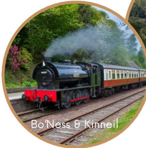
Bo'Ness & Kinneil

Please note excursion days are subject to change.