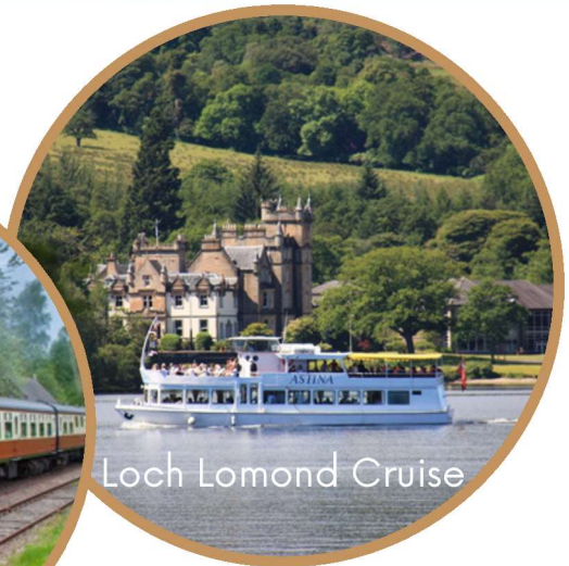
Loch Lomond Cruise